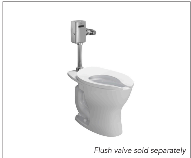
Flush valve sold separately